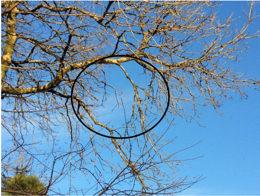
Figure 3: area of spreading deadwood over road.