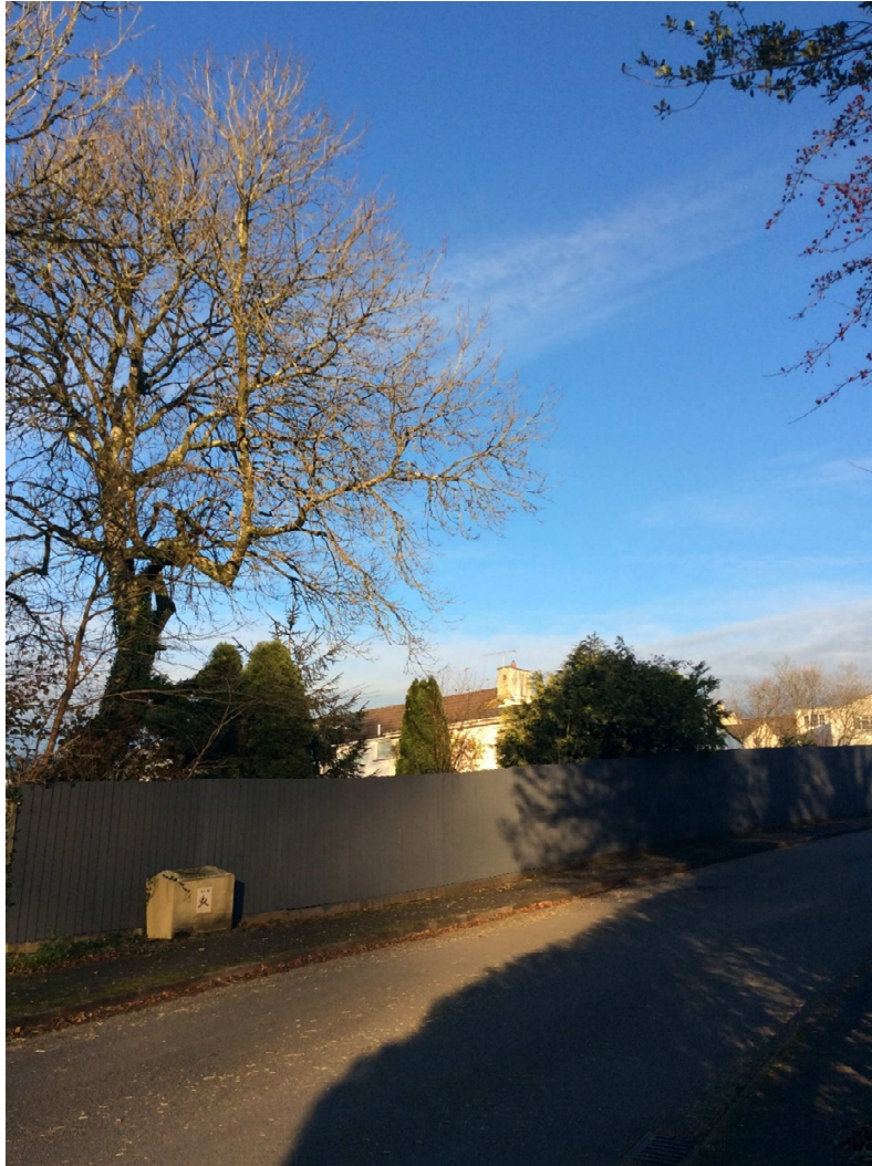
Figure 2: T1